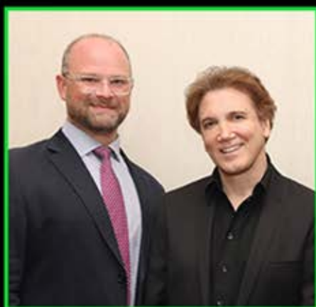
(The Confession of Lily Dare, The Tribute Artist)